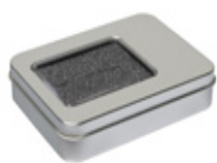
Tin 01 - Small Window