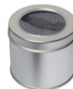
Tin 02 - Round