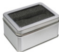
Tin 03 - Large